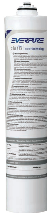
Claris Medium Filter Cartridge: EV4339-11

Everpure Claris water treatment systems (excluding replaceable elements) are covered by a limited warranty against defects in material and workmanship for a period of one year after date of purchase. Everpure replaceable elements (filter cartridges and water treatment cartridges) are covered by a limited warranty against defects in material and workmanship for a period of one year after date of purchase. See printed warranty for details. Everpure will provide a copy of the warranty upon request.